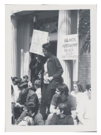
Students supporting the Takeover on the steps of the Bursar's Office, May 3, 1968

history and vulnerability of safe spaces on campus. Therefore, one of the many settlements was to establish my position, to designate someone to document and preserve the history and presence of black students, faculty, staff, and alumni of Northwestern University.