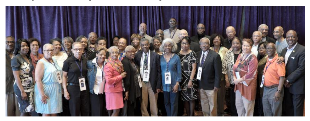
Reunion of 1968 Takeover participants, May 4, 2018

returned to campus for yet another historic moment in Northwestern's history. Many brought their families and friends. And alumni from post-1968 years also took part in the reunion. The weekend was filled with laughter as well as opportunities to hear firsthand from the protestors. Also, beloved deans of the Department of African American Student Affairs returned to campus to also participant in a panel discussion. Finally, the Northwestern Community Ensemble, Northwestern gospel choir, offered a musical tribute and the Department of African American Studies graduate students presented a theatrical performance.