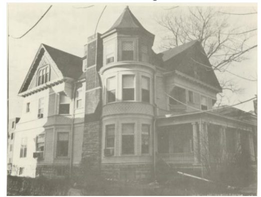
The Black House at 1914 Sheridan Road

Women's Christian Association's (YWCA) segregated Clay Avenue facility for African American women and girls from the 1920s to 1950s. It is a fascinating story of black women