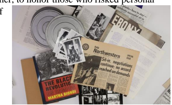
Takeover-related archival material from Northwestern University Archives

safety, enrollment status, and financial aid on behalf of all students. There was a campus-wide effort to plan and develop a series of programming to celebrate the student protestors and educate the community about this history and legacy. Even in my brief time at the university, I was responsible for advising university units and external groups about the history of the Takeover; provide archival material for social media campaigns, contribute to a video and documentary about the Takeover, and speak to this history to the media.